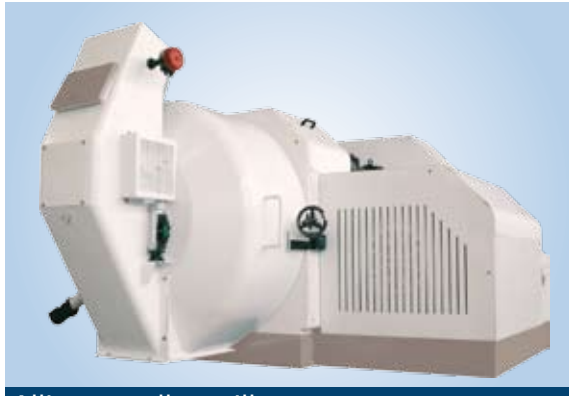
Alliance pellet mill

☐ Get more details on the web www.desmetballestra.com