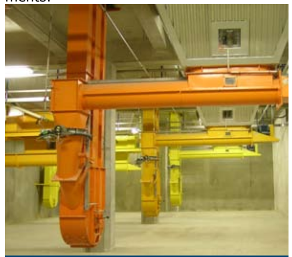
Elevator foot above ground with optimized discharge

For applications not included in this range, our design offices are qualified to develop specific conveyors meeting any requirements.