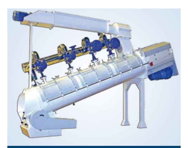
Super conditioner with steam injection

Our thermal treatment line mainly includes 2 machines: