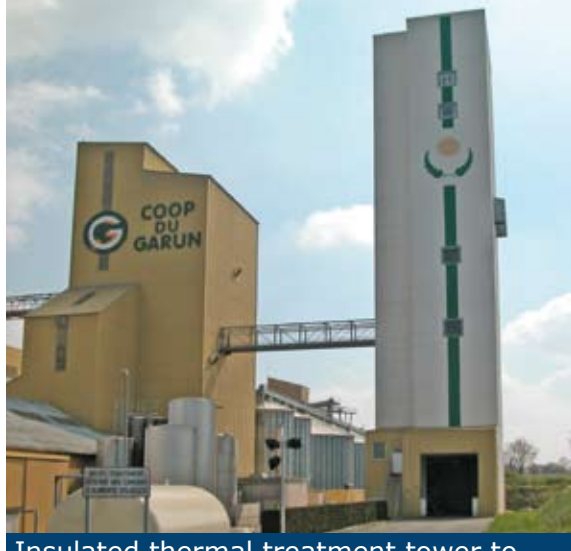
Insulated thermal treatment tower to limit contamination risks