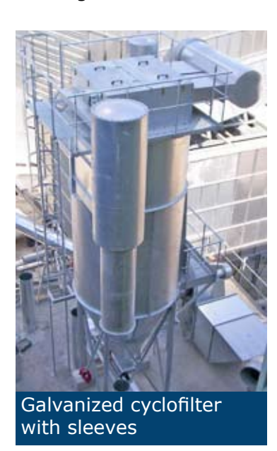
Get more details on the web www.desmetballestra.com

From a compact pads filter designed for bags unloading to the high capacity sleeve filter used for centralised cleaning, Desmet Ballestra Stolz can offer you solutions to your filtering needs.