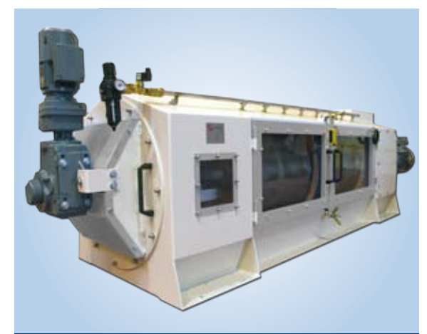
BCMT 750 Turbosifter

That concept, combined with our hammermill reputation and our high quality ABMS pneumatic feeder-metal remover-destoner appeal to several dozens of customers each year.