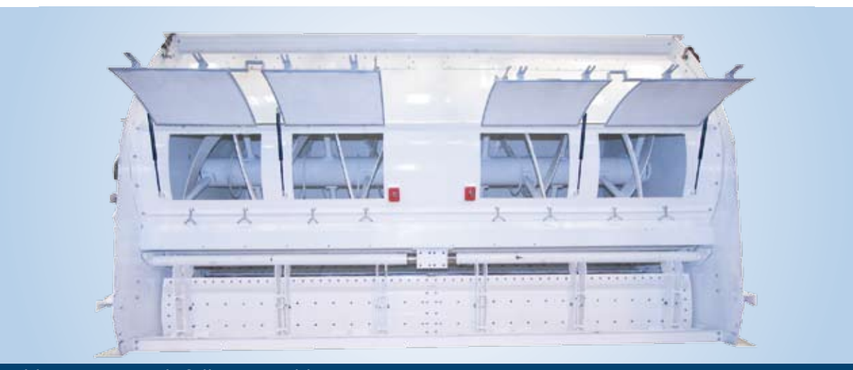
Ribbon mixer with fully opened bottom

Mixing solutions designed by Desmet Ballestra Stolz meet a wide range of requirements.