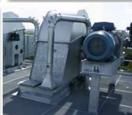
Elevators with discharge suction intakes