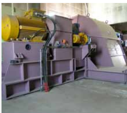
High capacity elevator head (1600 m 3 /h, height 65 m, 2x200 kW)