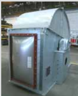
Explosion vent at elevator head

STOLZ solutions to limit explosion risks: